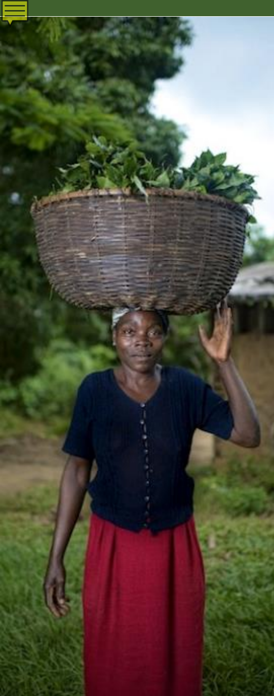
Thinking beyond the canopy